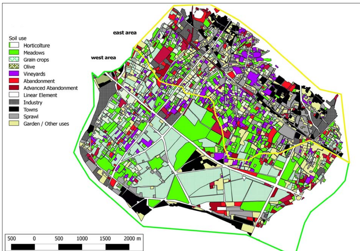
Figure 2. Land use map of the two areas. East part is yellow edged, west part is green edged.

Historical farmers disappearance causes both local knowledge losing, and degradation of the local production chain. This initiates a snow-ball effect because it enhances difficulties for the remaining farmers to keep activities going from a logistic point of view. How to dry and keep grain if no dryers and no silos are any more available at local level? how to sell little amount of production profitably?