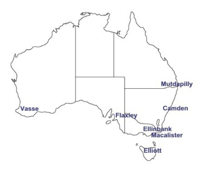
Figure 1: Dairy farmlet project locations in Australia.

A farmlet is a small grazing unit that simulates production conditions on commercial farms. On-farm production research has been conducted in Australasia for the past four decades using farmlets (McMeekan, 1966; Fulkerson, 1980; Thomas and Matthews, 1991). Traditionally trial designs have arranged these grazing units following conventional experimental protocols according to treatments, control and replication requirements. Historically a farmlet approach to systems RD&E has been focused on productivity gains, given less consideration to environmental issues, and neglected the social dimension to FSRDE. Consideration of the triple bottom line now requires a more inclusive approach (in terms of stakeholders and issues) to the design and evaluation of systems projects that use farmlets. There are currently seven farmlet studies spread throughout six states of Australia (see Fig. 1), each established at different times with separate objectives and research designs.