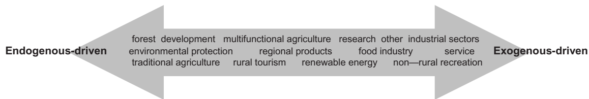
Figure 2. rural activities in the endogenous-exogenous continuum